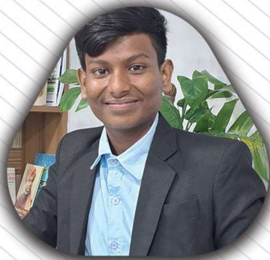
ALKAMA HOSSIN MARRIOTT, HYDRABAD